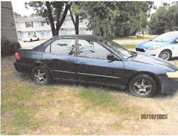
711 67th Ave N