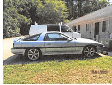
1270 Pinner Pl.