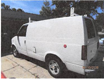
1270 Pinner Pl.