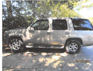
1510 Greens Blvd