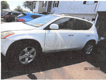
404 16 th Ave S