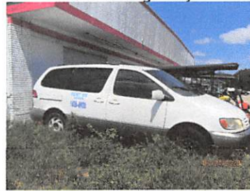
106 N Kings Hwy