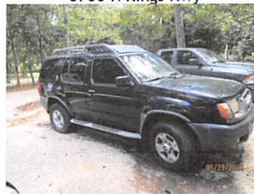
6700 N Kings Hwy