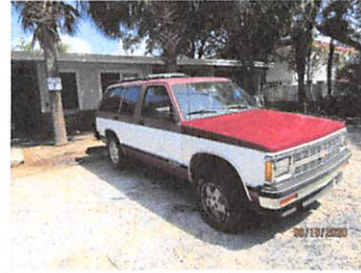
1306 Yaupon Dr.