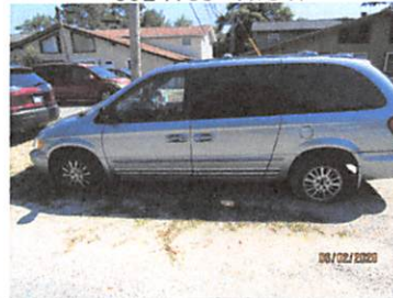
602-A 35 th Ave N

THE CONSTRUCTION SERVICES DEPARTMENT, CODE ENFORCEMENT DIVISION HAS TAGGED THE FOLLOWING VEHICLES IN ACCORDANCE WITH ARTICLE 41, CHAPTER 5 TITLE 56 OF THE S.C. CODE OF LAWS. SEVEN DAYS HAVE ELAPSED SINCE TAGGING AND THE VEHICLES HAVE NOT BEEN REMOVED. THIS FORM IS FORWARDED TO THE POLICE DEPARTMENT FOR FURTHER ENFORCEMENT ACTION AND DISPOSITION.