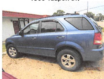
1300 Yaupon Dr.