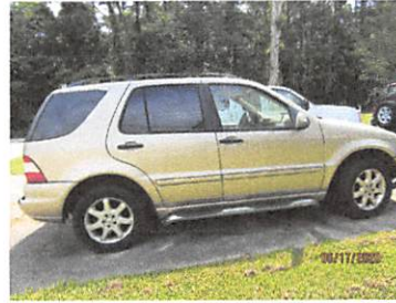
829 9th Ave N