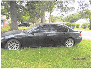
1160 Stalvey Ave