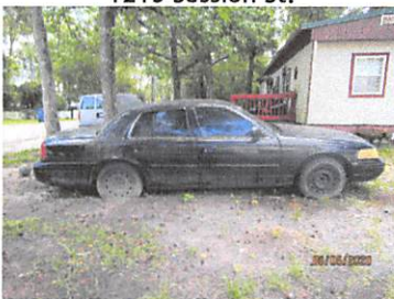
1215 Session St.