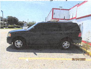
106 N Kings Hwy