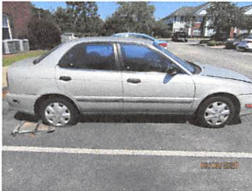
1223 Winchester Ct.