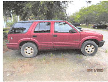
6207 Tindal St.